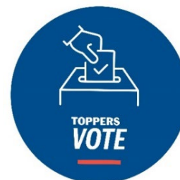
"I Voted" St. Edward's University